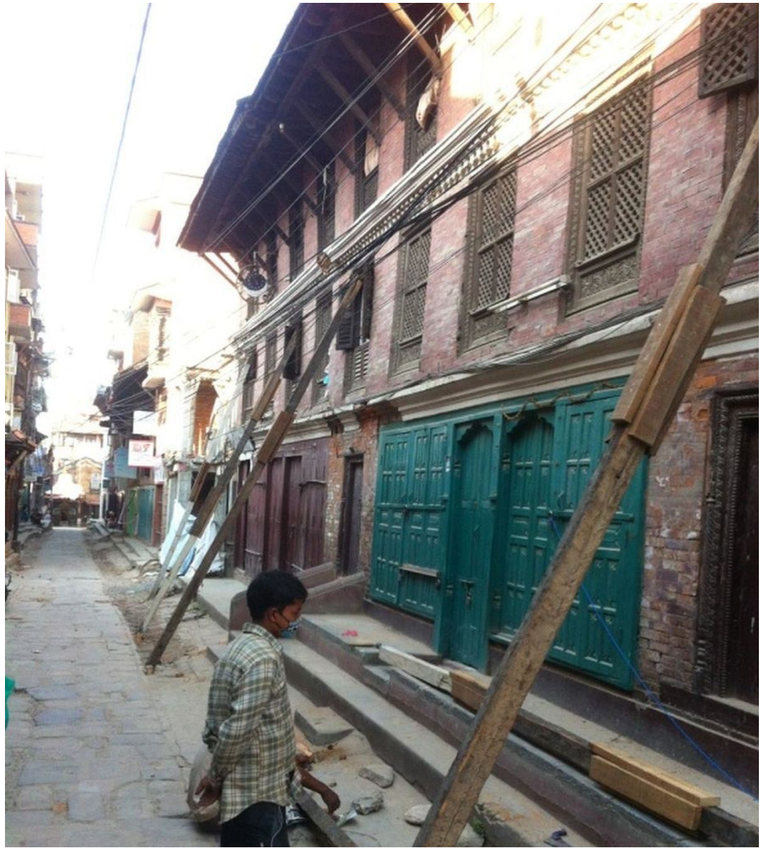
FIGURE 3: Damaged archeological monuments

Earthquakes usually inflict more injuries and morbidity than mortality and these injuries are predominantly musculoskeletal in nature [1]. Initial management at the time of an earthquake is often hampered by the destruction of basic infrastructures and hospital facilities due to shocks [2]. Due to the sudden, unexpected, and disproportionate increase in the number of trauma patients as well as limited surgical and anesthetic support, often early definite orthopaedic management is usually not possible. The role of orthopaedic surgeons during rescue missions in such situations is, therefore, important [3]. We report the injury pattern and profile of musculoskeletal injuries managed by our team soon after the 2015 Nepal earthquake, within a short span of three days.