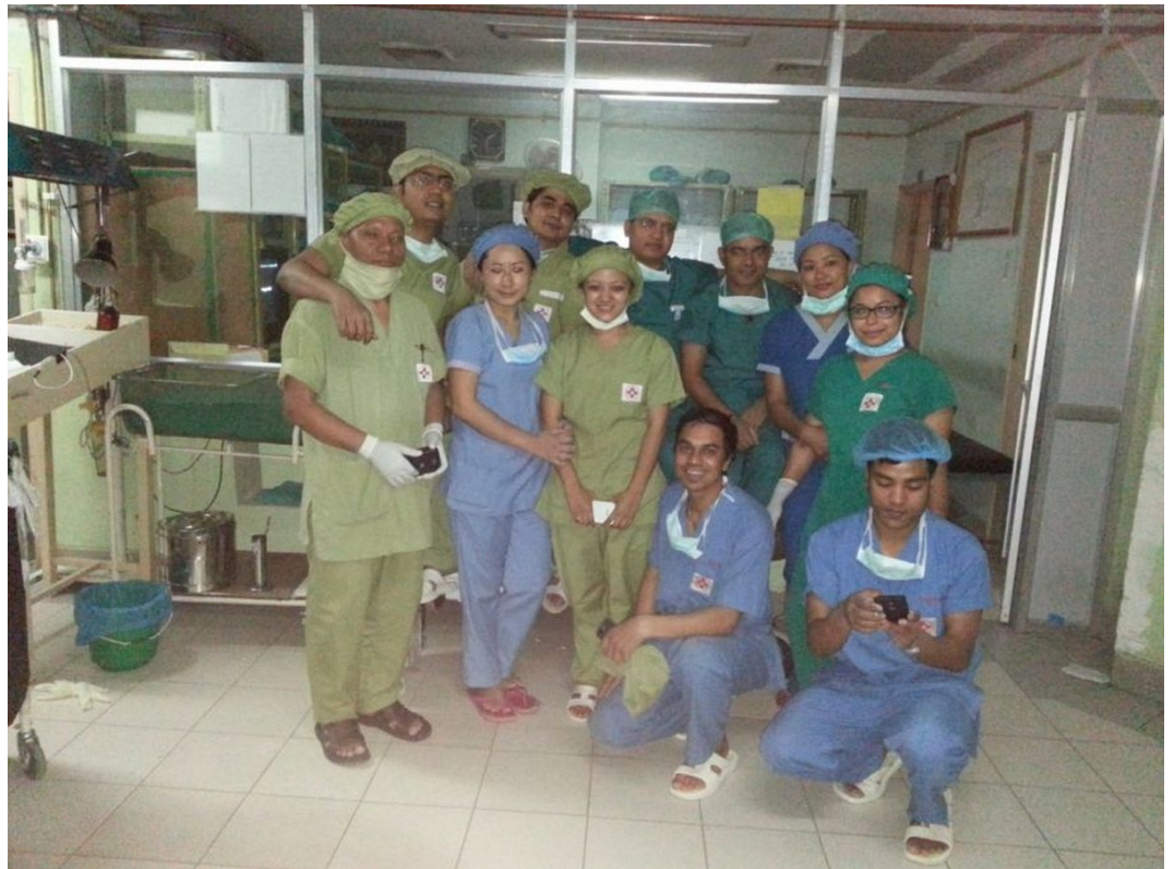
FIGURE 6: A combined force of local and guest surgical team members

The injuries treated included that of the upper limbs, lower limbs, and spine. Almost all the major bones of the body were injured in different patients and were fixed accordingly. Out of nine patients with open injuries; five patients had a Gustilo Anderson Grade IIIA injury, three patients had a Grade IIIB injury, and one patient had a Grade II injury. Out of these nine patients, eight patients had lower limb injuries whereas only one patient had an upper limb injury. All these open injuries were managed by debridement and external fixation. We tried our best to avoid any amputation, but four patients had badly mangled extremities that could not be saved in spite of our best efforts. Out of these four patients; two patients had below the knee amputation, one patient had above the knee amputation, and one patient had a below the elbow amputation (Table 1).