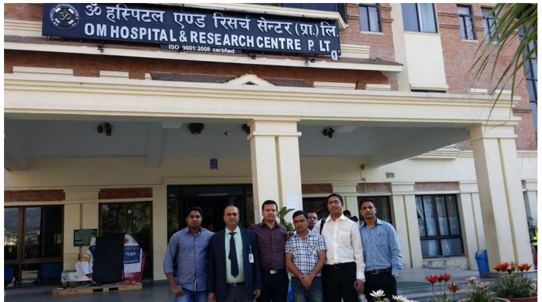
FIGURE 4: Rescue team members in front of local hospital at Kathmandu

Eighty earthquake victims with orthopaedic injuries were treated by a team of six medical staff at Om Hospital, Kathmandu (Figure 4).