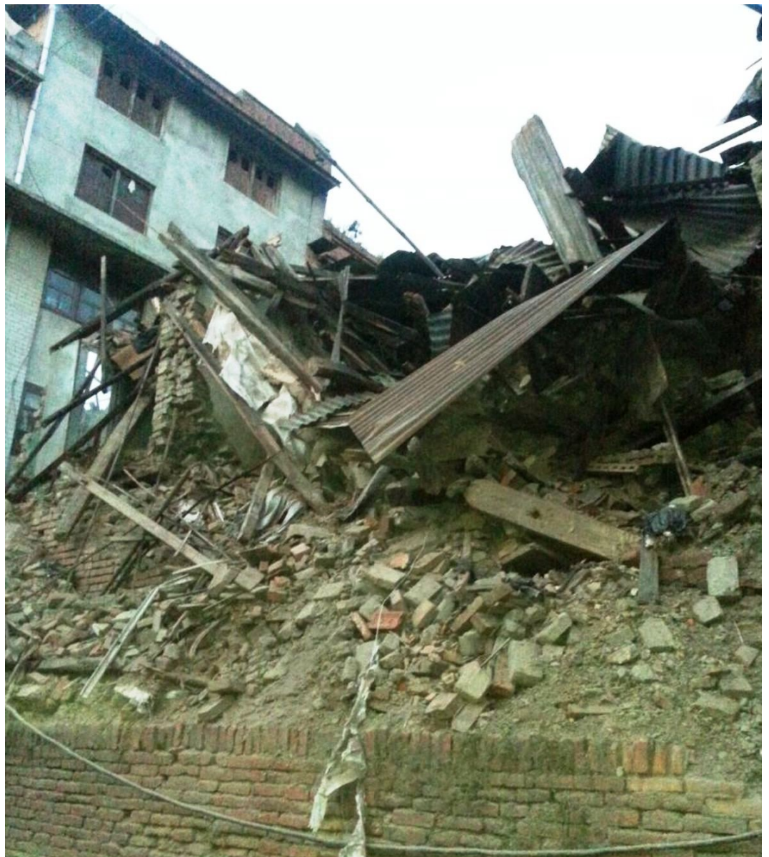
FIGURE 2: Severely damaged and collapsed buildings mainly responsible for injuries.

There were more than 8,000 deaths and more than 14,000 people were injured. This earthquake triggered an avalanche on Mount Everest killing at least 19 mountaineers also. Thousands of people were made homeless across many districts of the country. Many archaeological monuments and centuries-old buildings were destroyed (Figures 2-3). Many buildings were ready to collapse due to earthquake-induced cracks, and these buildings were supported by logs of wood temporarily.