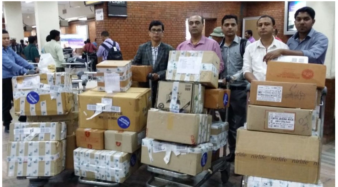
FIGURE 5: The rescue team arriving with medical supplies

All 1,300 patients were first managed at the emergency department. The patients with minor injuries were treated (e.g, repair of lacerations, casts for non-displaced and minor fractures, etc.) by the emergency medical staff. Only those patients (80) with significant limb and spinal injuries were referred to our team for surgical management. All the patients who required surgical intervention underwent necessary preoperative laboratory and radiological investigations. Compound and crush injuries were given the priority over the closed injuries. The preoperative planning of all the cases was done prior to surgery on a ward round with the local medical team. We had adopted the principle of orthopaedic damage control for the treatment of these victims, whereby the emphasis was given to treat as many people as possible with available medical resources and to achieve maximum gains by doing minimum interventions.