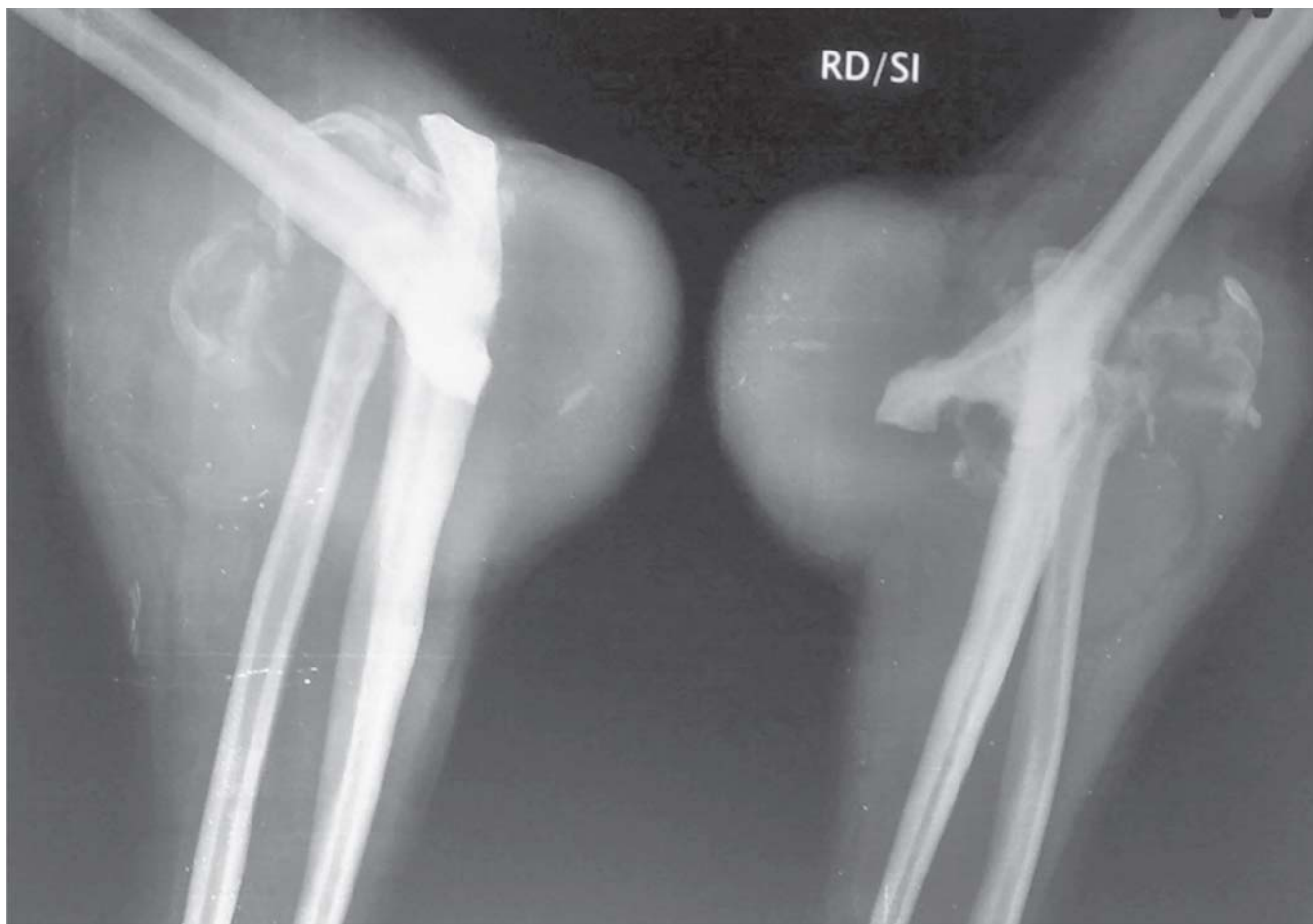
Fig.1. Pre-operative X-ray showing asymmetric and severe destruction of elbow joint.