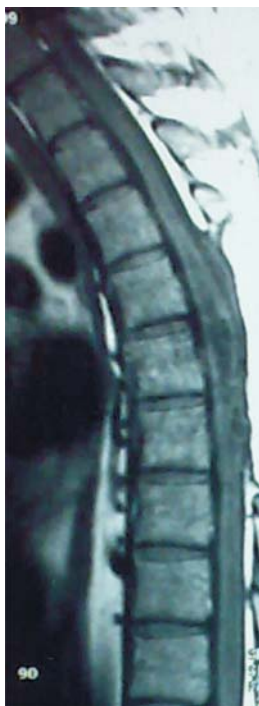
Fig.2. MRI image showing extensive syrinx involving cervico-dorsal cord.